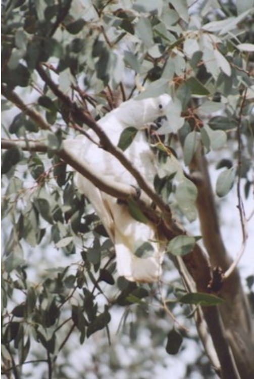
Cockatoo - Perched in and Chewing on a Eucalyptus Tree in Australia

orange, would certainly get essential oils sprayed into and onto the bird. How could birds possibly have issues with essential oils when every branch they chewed, and nest they built were almost definitely exposing them to essential oils of those plants?