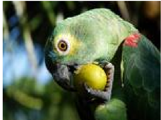
Amazon Parrot Chewing Through a Citrus Peel

Well, in humans Oregano or Clove essential oils are most commonly used to get rid of warts. Unfortunately, both of these oils are pretty “hot”, and so a challenge became how to administer the beneficial oils to the bird. Since the papillomas act like a tumor; I thought of the most mild oils that I could, and derived what I thought was a brilliant plan to apply the oils to the feet of the bird. Emmett was not a cuddly parrot as some birds are. He stayed in his cage and couldn’t be handled. I decided we would mix 20 drops of Frankincense and 5 drops of Copaiba into a 4 ounce glass bottle of distilled water. Then this mixture would be “sprayed” onto his feet – thus allowing him to have his oils absorbed by his feet (the safest place to apply oils in a human). I had picked Frankincense as it is a powerful anti-tumor oil, as well as gentle enough for newborn babies. I also picked Copaiba for its gentleness, magnifying properties of other oils, and anti-inflammatory action. Certainly these tumors had invaded many areas, and were surely causing massive inflammation and problems. Of course, the plan was to aim for his feet when spraying him, but I was concerned...“what if we got this spray into his eyes?” Well I am not one to ever