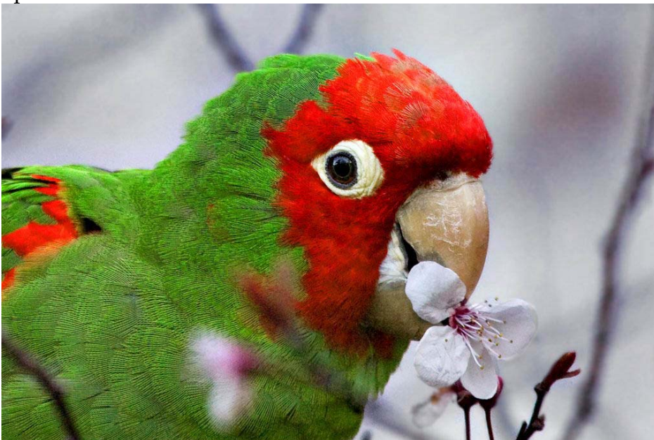
Conure Chewing on a Flower – Getting Exposure to Essential Oils

Emmett's story continues to evolve. We are not done treating him, and likely won't ever stop supporting his previously damaged immune system with essential oils. At the date of writing this – Emmett's papilloma - that was so obvious in his initial video – is completely gone. The hope that this gives to all birds suffering from Papilloma Virus – is jaw dropping. When I graduated from veterinary college, it was with a distinct interest in Avian Medicine and Surgery. I had planned to become the first Board Certified Avian Vet in Minnesota. However, I quickly became frustrated with the lack of results that traditional avian care offered my patients. Essential oils have renewed my hope in finding effective natural treatments for birds; for conditions that currently have no options.