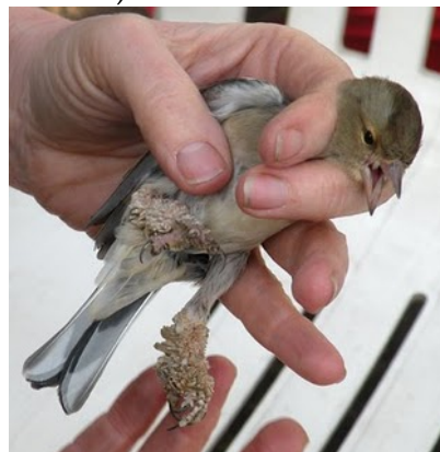
Avian Papillomas affecting the feet (Severe Case)